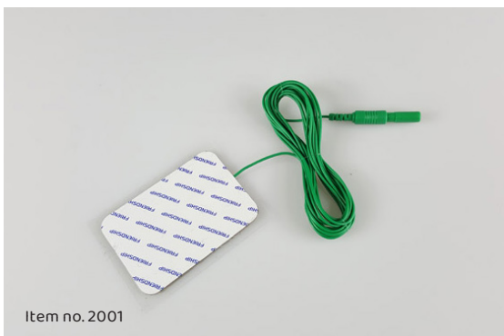
Item no. 2001

If you need a product not shown in our product portfolio, or require a product modification to meet your exact needs, please contact our sales office. Our representatives will be happy to discuss your requirements and where possible find a solution.