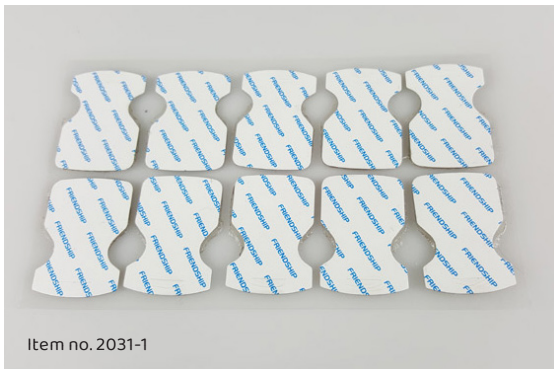
Item no. 2031-1