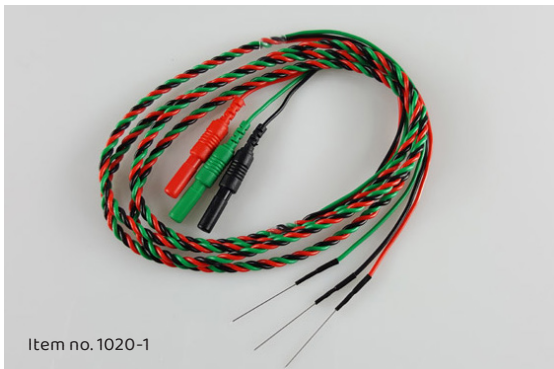
Item no. 1020-1