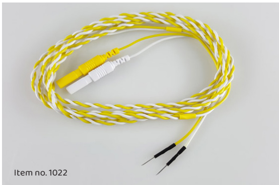
Item no. 1022