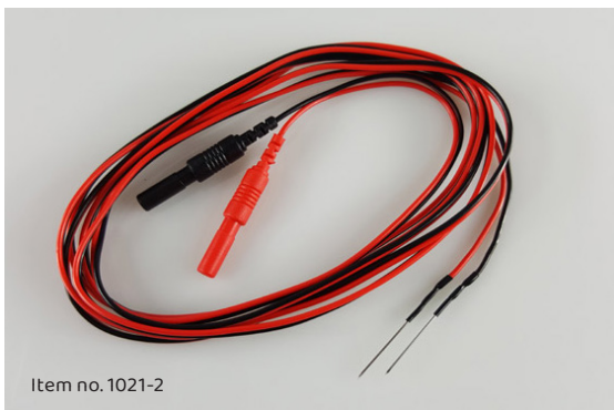
Item no. 1021-2