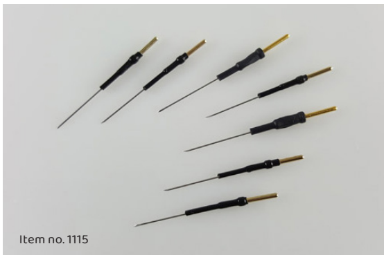
Item no. 1115